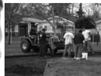
Rossmoor Park Community Center